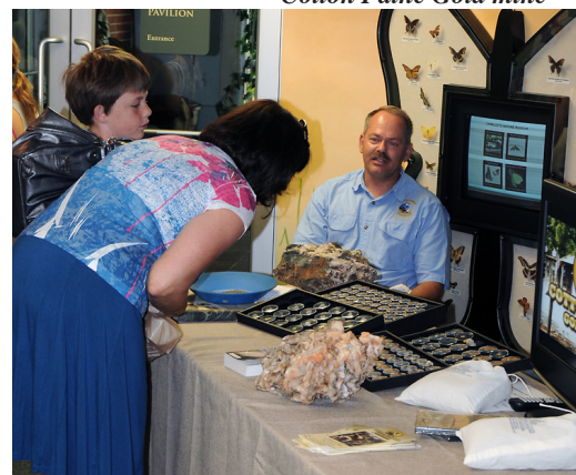
Cotton Patch Gold mine