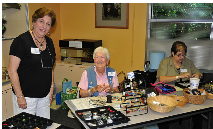
Craft & Jewelry Central