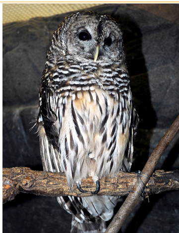
Museum Staff Watchman!

Just beyond the Sunspot room was the Naturalist Lab, or for this par-