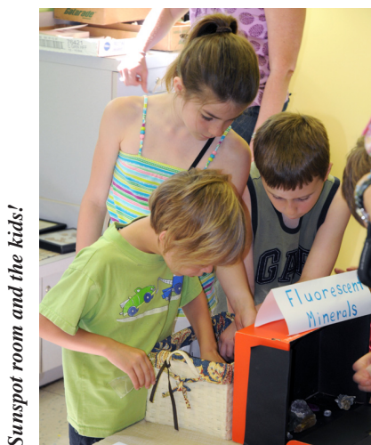
Sunspot room and the kids!