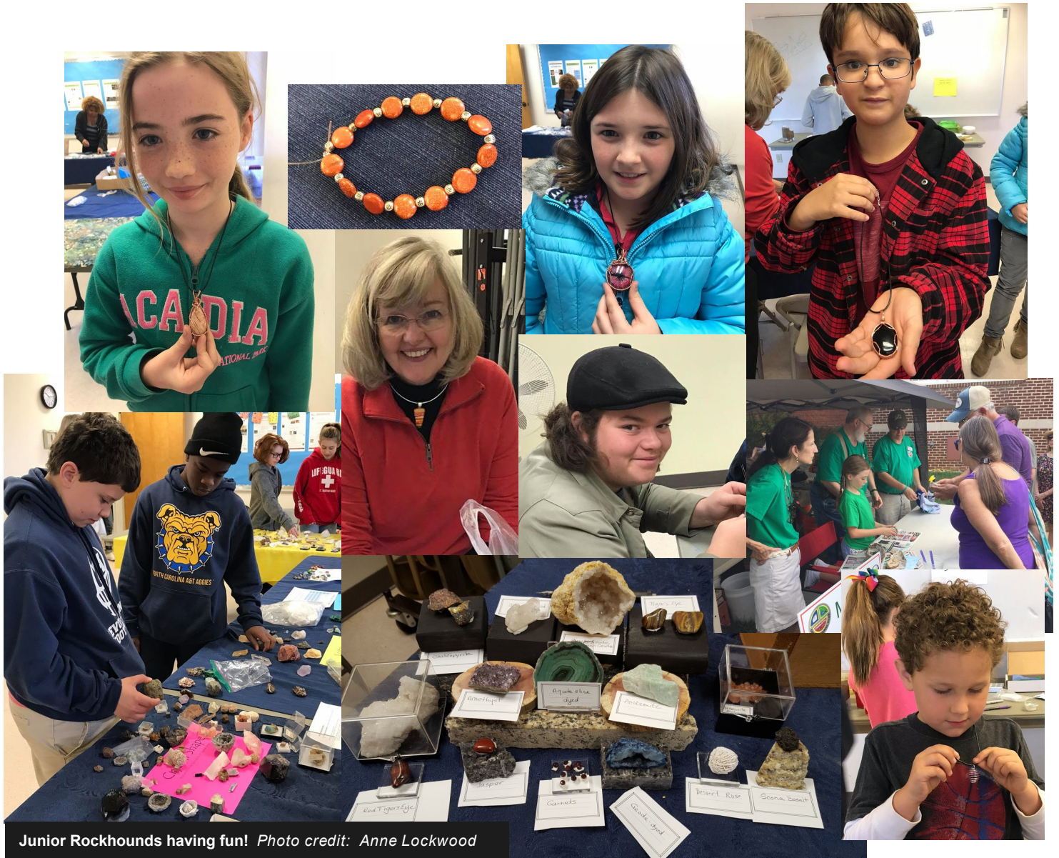
Junior Rockhounds having fun!

Our older Junior Rockhounds also help at Matthews Alive. The group has been doing some great work this year - here are a few pictures from recent meetings: