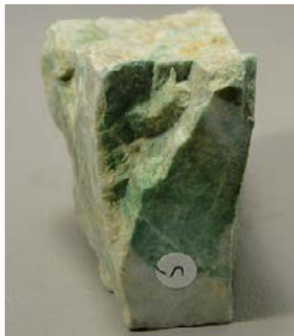
Maw Sit Sit rough rock