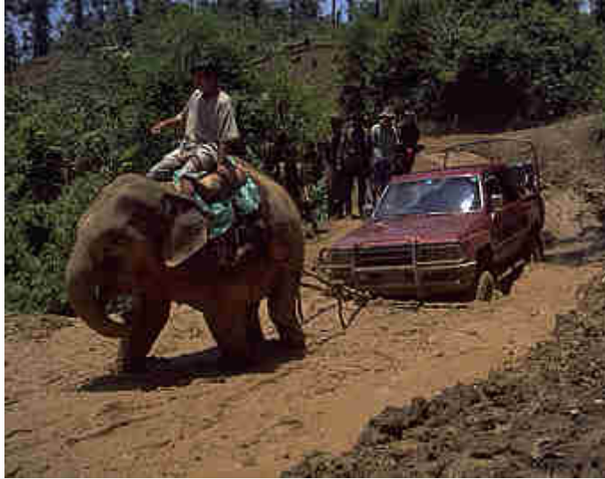
Elephants shriek and strain to pull a stranded truck from the mire of the Hopin-Hpakan road.

Mining Maw Sit Sit is still mined in the same manner as Imperial Jadeite has been mined for centuries; by hand, in the mud. The only modernization has been the addition of power tools and dynamite. Due to the fact that the mining area is very remote, and that trucks don't travel well to the site, miners have to continually dodge the automobile graveyards of those less-fortunate vehicles mired in the muck. Miners have resorted to using teams of elephants to un-stick the vehicles from mud holes during the rainy season.