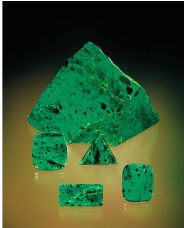
Rough and cut maw-sit-sit

The stone is a deep emerald green to bright neon or apple green color and can be mottled, veined or striped with black or darker green. Maw Sit Sit has no real crystal structure and is formed by regional metamorphosis of igneous rocks, probably from the pressure of the Indian plate colliding with the Eurasian plate which formed the Himalaya's.