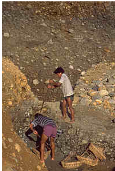
Mining jade at Maw-sisa, near Lonkin, Burma.

Often the miners will inspect a stone for several minutes and then toss it aside because they can't figure out whether it is a valuable piece of Maw sit sit or just a rock. The dike being mined is estimated to hold years worth of material so even though the stone is rare, it's not likely to run out in the near future.