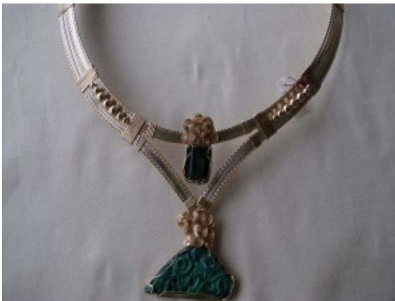
A beautiful Maw Sit Sit wire wrapped necklace by Mint Schlieff. The lower pendant a carved triangle, and the upper, an emerald cut stone, both set in gold filled wire.

If you are fortunate enough to purchase a piece of rare Maw Sit Sit, treat your Maw Sit Sit as you would turquoise; never put it in a steam, ionic or sonic cleaner; use only soap and water to clean it. Don't expose your stone to extreme temperature changes and be careful to store it away from harder stones that could scratch the surface.