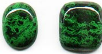
Cabochons of Maw Sit Sit

Maw Sit Sit is a temperamental stone. It's about a 6 to 7 on the Mohs' hardness scale, but can vary from 5 to 7, depending on the mineral makeup of the stone. It is usually cut en cabochon or round beads as it is difficult to facet given the tendency to have soft spots within the material when cutting and polishing.