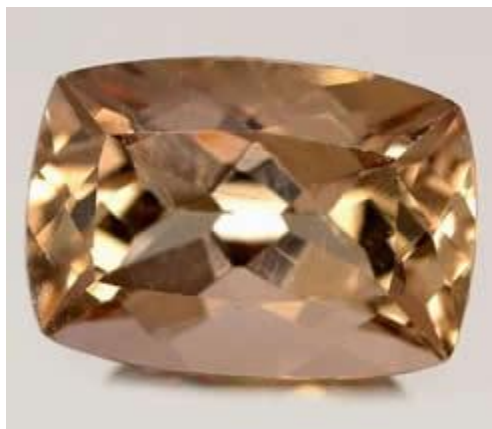
Cushion Cut Axinite Gem

The different members of the axinite group vary slightly in composition. The axinites are defined as calcium aluminum boro-silicates by composition. Members of the group are distinguished depending on whether the calcium is replaced by iron, magnesium or manganese. As the chemical composition varies, there are corresponding differences in color and specific gravity or density .