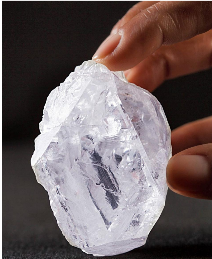
Lesedi La Rona diamond at Sotheby's on May 3, 2016, in New York City.

In the end there are very few people in the world able to buy such a gem and even fewer with the capability to cut it. The top name on both lists is Graff. By being patient Laurence Graff may have shaved at least $17 million from the asking price of the diamond.